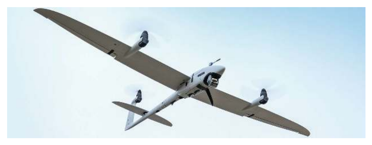
Quantum-System Vector UAS with Raptor Camera Sensor

The Vector Vertical Take-Off and Landing (VTOL) Unmanned Aerial System (UAS) provides capabilities to both military and security forces that exceed the performance of current tactical UAS platforms in service all over the world. It is a military grade UAS built to last and bring capabilities to the battlefield not available today.